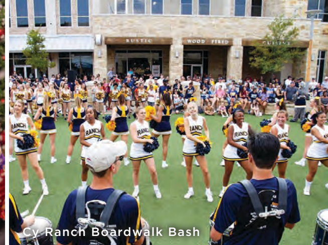
Cy Ranch Boardwalk Bash