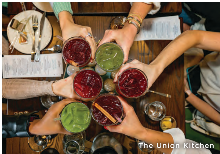
The Union Kitchen