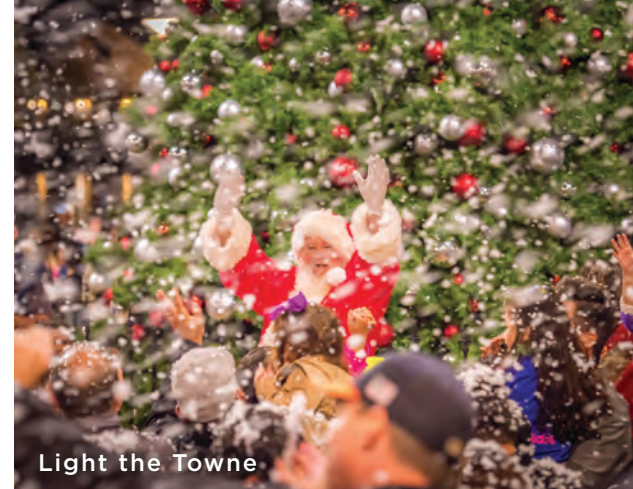
Light the Towne