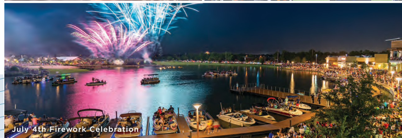
July 4th Firework Celebration